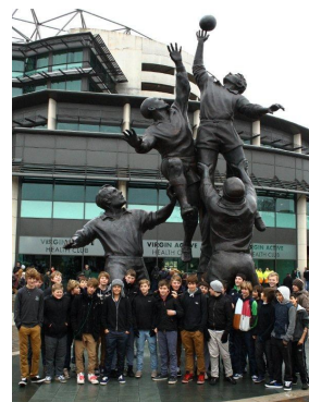
LVC students at the Varsity rugby match at Twickenham on 8 December